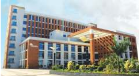
State of the Art Infrastructure