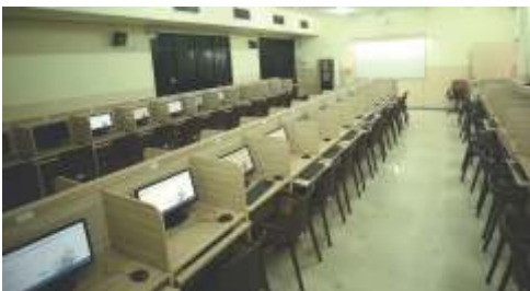
Fully Equipped Computer Lab