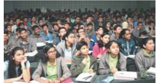
Spacious & Air Cooled Classrooms