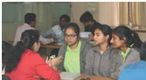
Doubt Clearing Counters