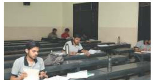
Self Study Lounge (Boys / Girls)